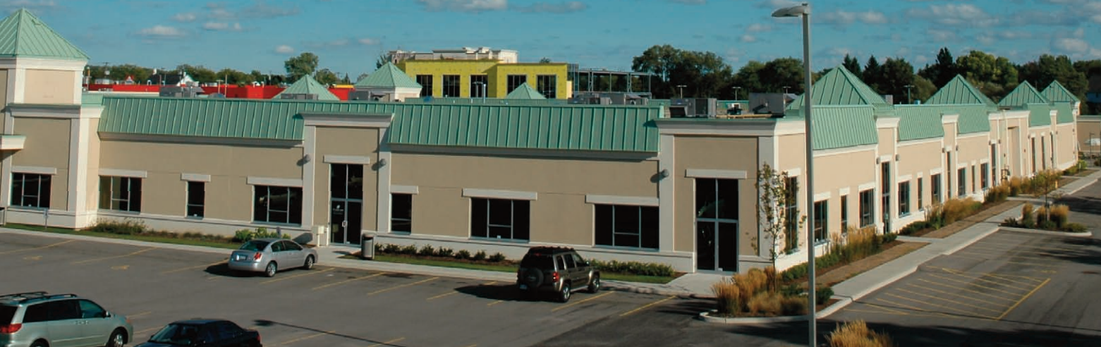
The name Lulu's lived on long after the night club closed. Today the property has been revitalized as Deer Ridge Centre.

DEER RIDGE CENTRE A PRIME EXAMPLE OF DEVELOPMENT NEAR KITCHENER'S 401 ACCESS