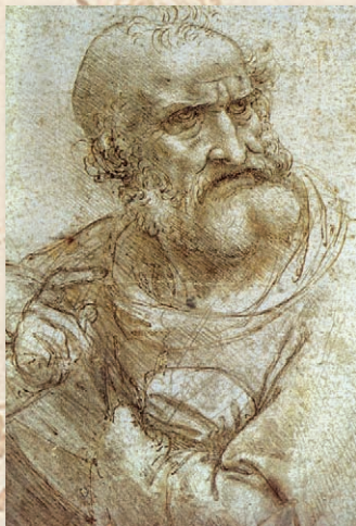
STUDY FOR THE LAST SUPPER c.1495