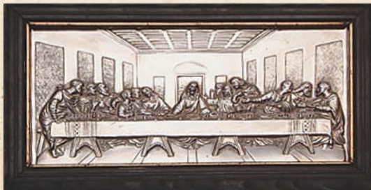
LAST SUPPER ETCHNG